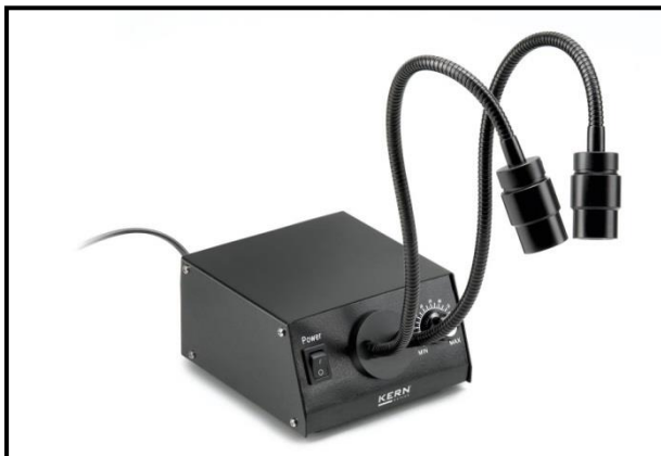
Typical goose neck lighting unit

The lighting units which are suitable for devices of the OZL-46 series, are goose neck lighting units ( see figure ). These are available as LED as well as halogen versions and also have an on/off switch or different controller.